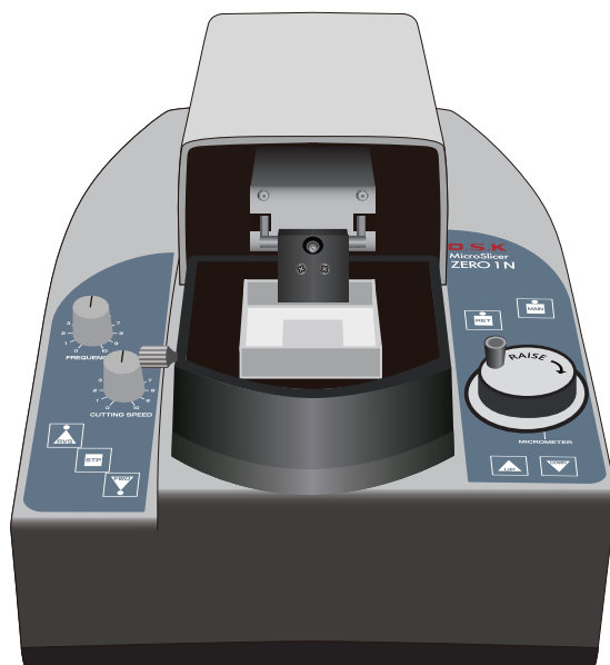
ZERO 1N Standard Model